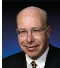
Kenneth D. Burman, MD

Risk factors for malignancy include a history of differentiated thyroid cancer in an immediate family member, experiencing external-beam radiation or exposure to ionizing radiation as a child or teen, prior diagnosis of thyroid cancer and male gender. Nodules that are benign tend to remain relatively stable in size. Nodules that are firm or immobile are more likely to be cancerous than those that are soft or mobile. A blood test to measure thyroid hormone levels should be routinely performed in patients with a thyroid nodule.