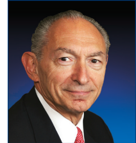
Leonard Wartofsky, MD

Nodule size, clinical context, and characteristics seen upon ultrasound are used to guide the decision to perform a fine-needle aspiration biopsy for further testing. The authors recommend that in the absence of growth or suspicious clinical or radiologic findings, patients with thyroid nodules with benign findings upon fine-needle aspiration can then be managed by observation , while those with nodules that show malignancy or suspicion of malignancy should be referred for surgery.